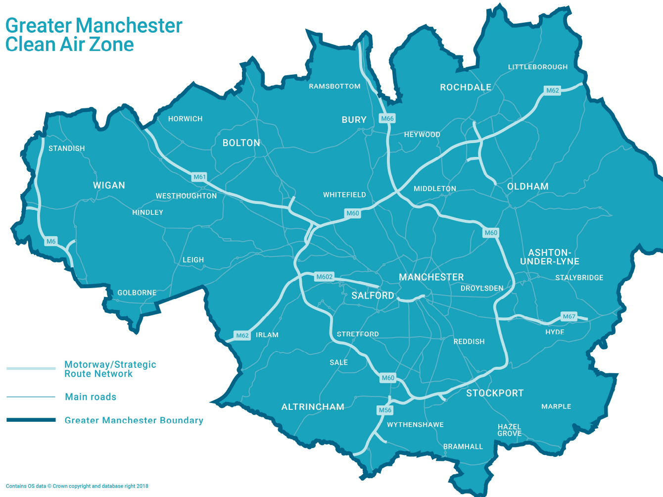
Greater Manchester Clean Air Zone

Cars (other than private hire vehicles), motorbikes and mopeds are out of scope.